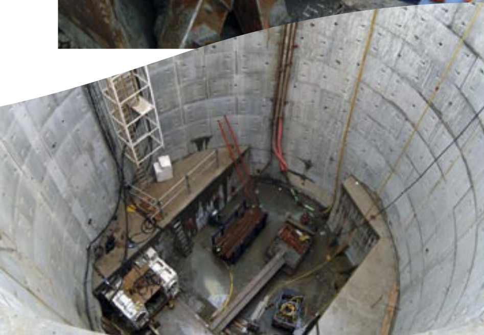
Preparations of the shaft at Bacton

BBL is scheduled for completion due 2006. Preparatory work in Bacton is now finished. The purpose of this work was to facilitate the pipeline landfall at Bacton through the construction of a shaft and a tunnel. The contractor began this preparatory work in October last year. The first step involved excavating a mound of soil at the shaft site. A start was then made on placing the first shaft ring. The shaft has an internal diameter of approximately 10 metres and a depth of approximately 17 metres. The next step in the project was to build the tunnel. This has now been done.